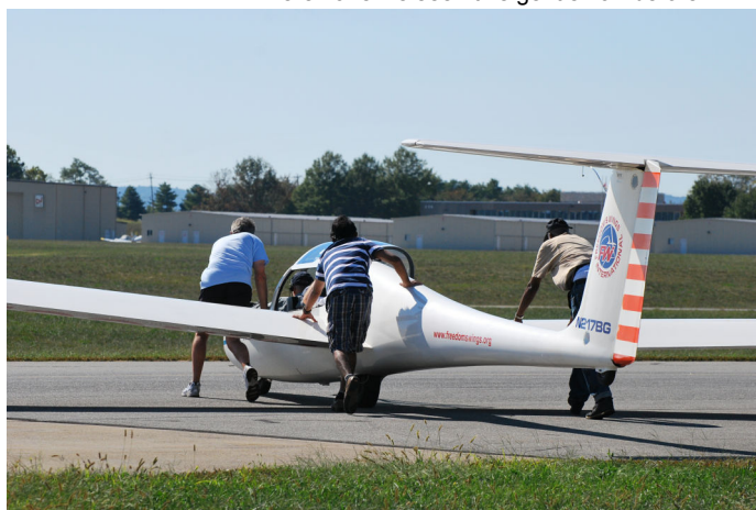
...rolling out to hook up