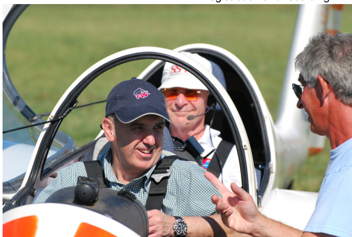
Where have we seen this gentleman before?