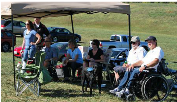
...registration and recording